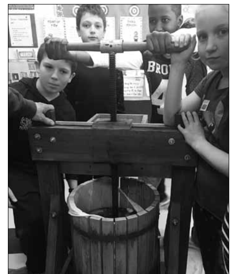
MAINE DAY—For the past nine years, students at George B. Weatherbee School have learned a lot about Maine on “Maine Day,” which celebrates Maine’s birthday, which was March 15 this year. Students were able to attend five 45-minute workshops out of a total of 32 workshops that were offered. The workshops covered a wide range of topics, including: stone and bone tools that have been used throughout the last 12,000 years in Maine apple cider making, building your own lighthouse, cribbage, fiddle and dance steps, fly tying, and knot tying.

The 5K road race on June 3 at the Cumberland Fairground is the culminating activity for Girls on the Run. More than 900 girls from throughout Maine are expected to participate in the event.