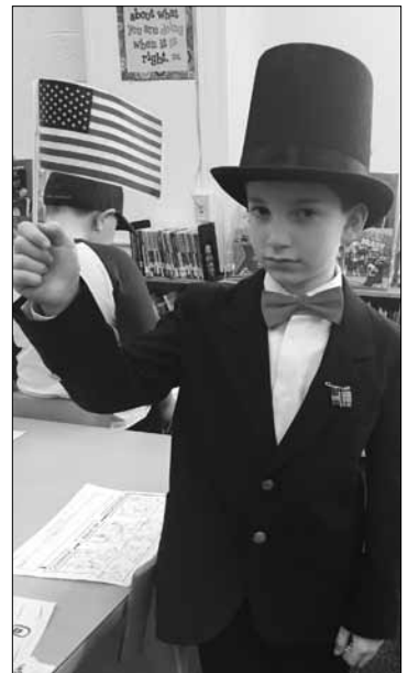
After reading their biographies, Weatherbee 3rd graders dressed up in costumes of famous Americans and portrayed them in a classroom Wax Museum.