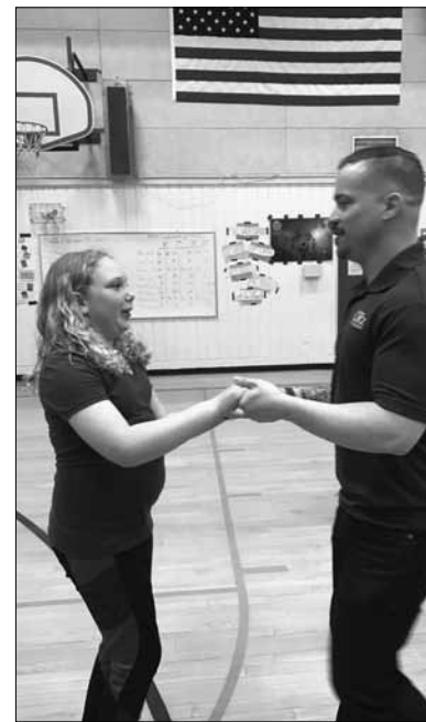
Salsa dancing with the instructor.

salsa dancing. More than 70 people participated in the gym to practice their salsa skills.