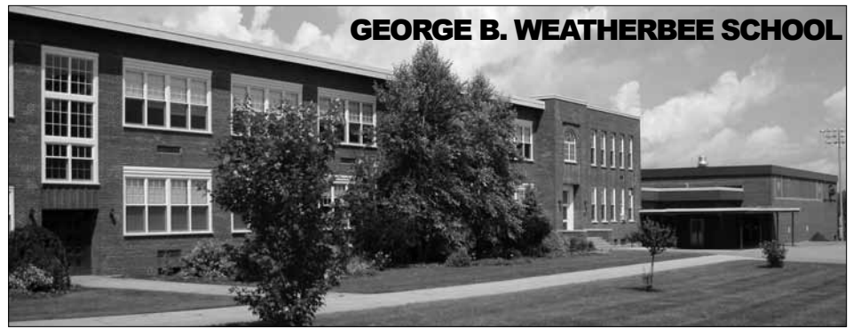
GEORGE B. WEATHERBEE SCHOOL