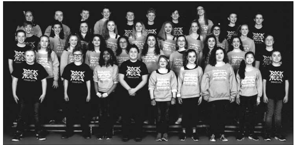
The Reeds Brook Middle School Show Choir.