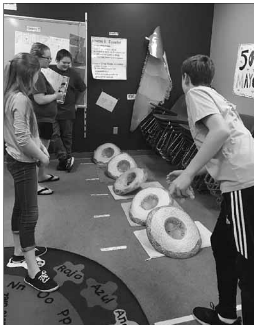
A Cinco de Mayo activity at Reeds Brook.