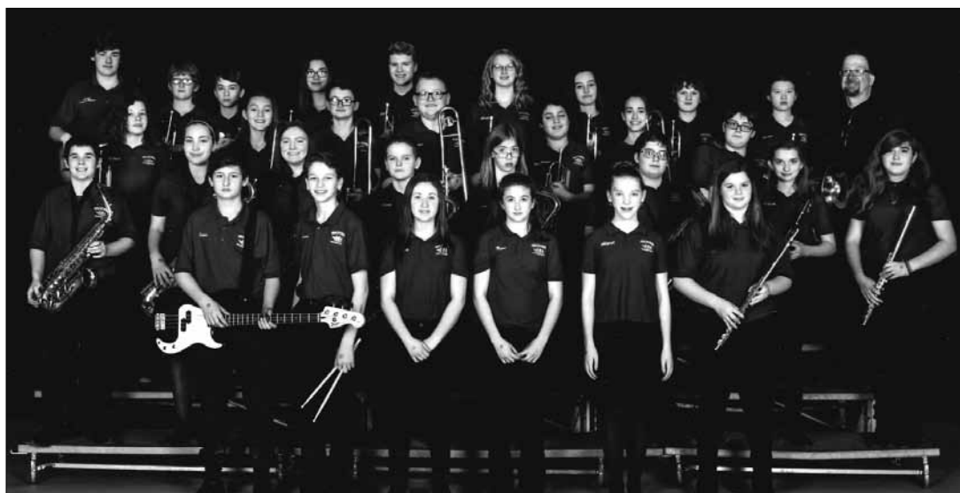
The Wagner Middle School Jazz Band.