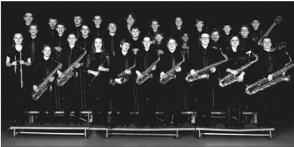
The Reeds Brook Middle School Jazz Ensemble.