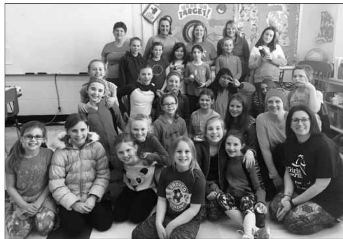
Weatherbee School Girls on the Run.

The 10-week program, which started in February, is led by gifted