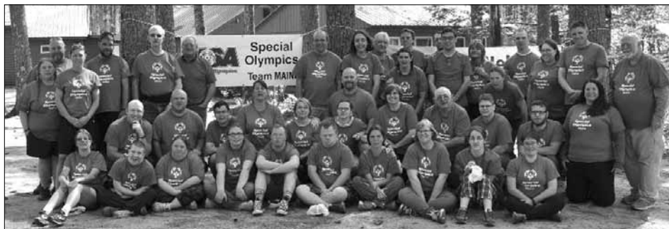
Team Maine, which will be going to the Special Olympics USA Games in Seattle July 1-6.

the Budget, a copy of the warrant articles, and a sample ballot for the June 12 referendum can be found on pages 8-10.