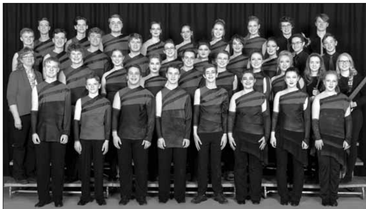
Voices Unlimited.

The concert will culminate with all 185 students performing a medley of Bee Gees tunes arranged especially for Hampden Academy.