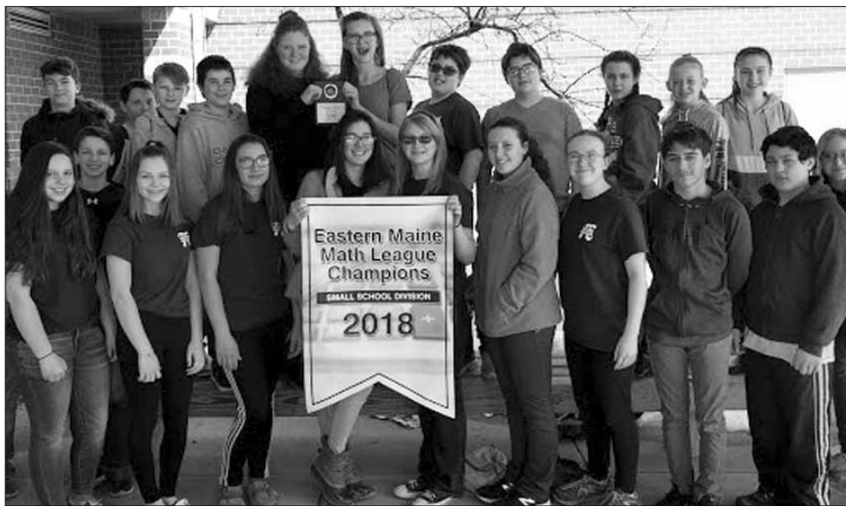
Wagner Middle School Mathletes, who won the Eastern Maine Math League Small Schools Championship for the second year in a row.