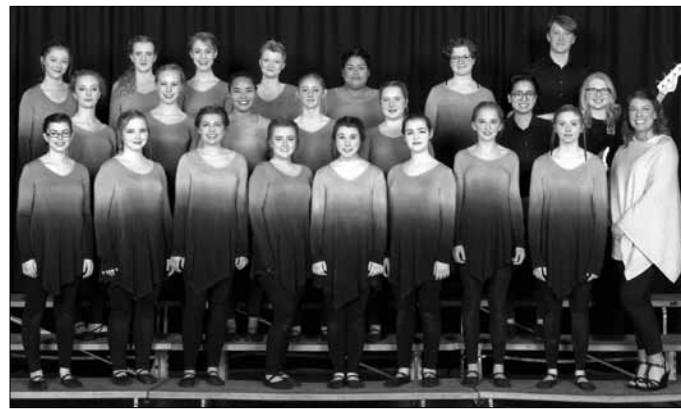
The Ascension Show Choir.