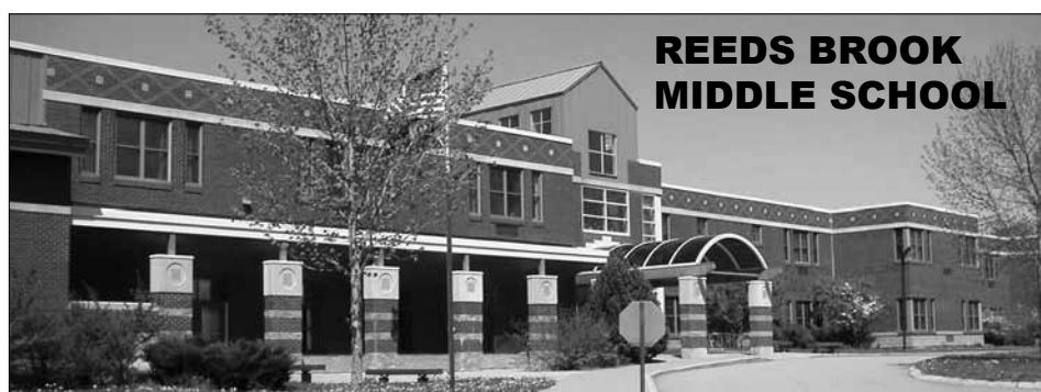
REEDS BROOK MIDDLE SCHOOL