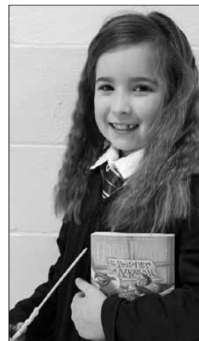
Smith School students don costumes to portray characters from their favorite books.

a chance to dress up as their favorite book character and march in a character parade. This is always a highlight for students and a fun and exciting time for all. I'm sure students and staff are already planning their costumes for next years parade. Smith School staff hope that this event encourages students to read more, but most importantly to develop a love of reading that they can carry with them throughout their lives.