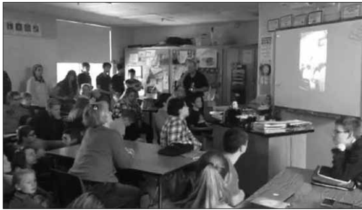
A class at Reeds Brook watches the naturalization ceremony.

Most of the Maine Day program will take place after lunch. The Maine Forest Service helicopter will arrive at 10 a.m. because it's less likely to be needed to fight wildfires in the morning.