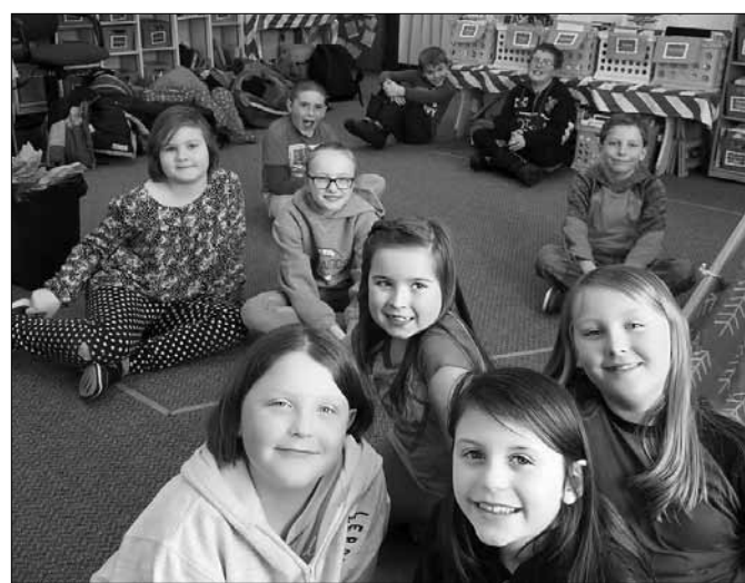
Some Civil Rights Team members during a meeting.

Throughout the week Civil Rights Team members read important messages during morning announcements, students participated in fun theme days and attended an assembly highlighting some fun and important messages from the