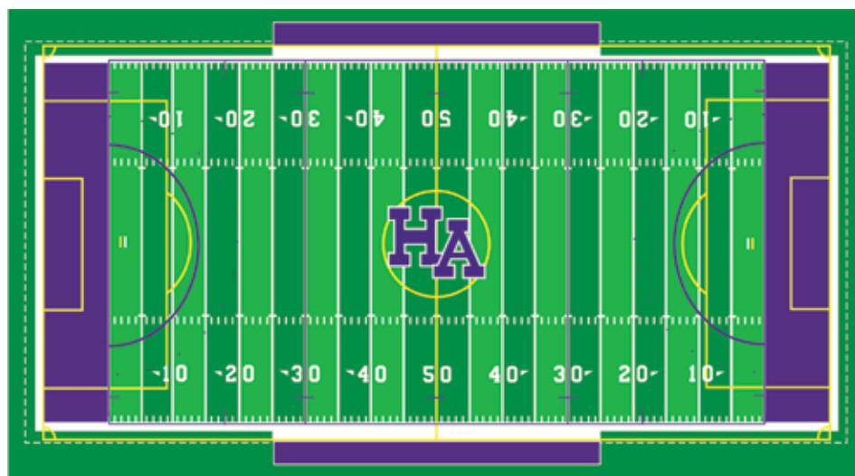
Designer's rendering of the new turf field for Hampden Academy.

The new turf is expected to arrive on June 22. The official project