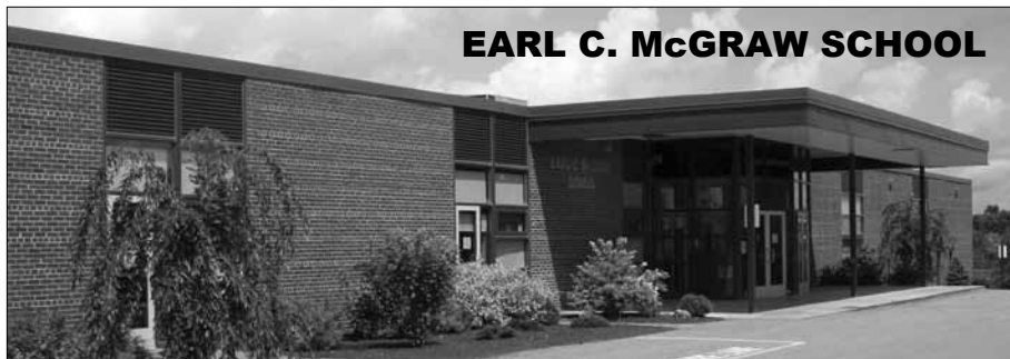
EARL C. MCGRAW SCHOOL

We had a Wacky Wednesday and all went a little wacky with