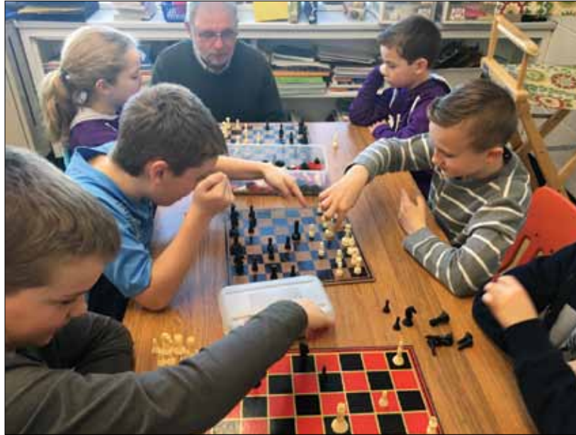
Students enjoy Friday morning chess at Weatherbee School.