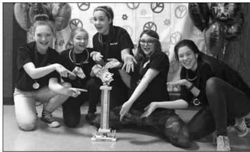
"The iLLAMAnati Tribe"